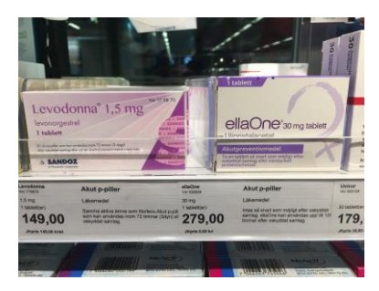
EC on the pharmacy shelf in Sweden

Elsewhere in Europe and in North America, LNG-EC can be purchased directly from the shelves without a mandatory consultation, as the pill is known to be extremely safe and there are no contra-indications to its use.