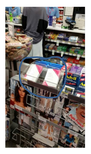
EC on the pharmacy shelf in the US

In the UK, the preservation of a mandatory consultation has been advocated for on the basis it provides an important opportunity to give a woman information about all her contraception options – both "emergency", including the copper coil (IUD) and ongoing – STI screening and any other sexual health questions she may have<sup>1</sup>. We undertook a study to explore what information was given during a consultation with a view to better understanding whether the value of that information offset the additional barriers created by requiring that emergency contraception can only be sold by a pharmacist (no other pharmacy staff including technicians) following a consultation, and to document what those barriers may be.